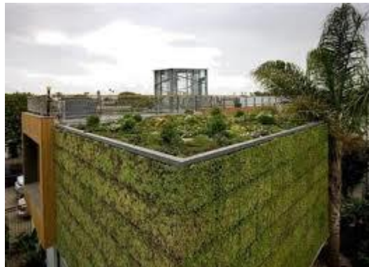
Above: Examples of green builds